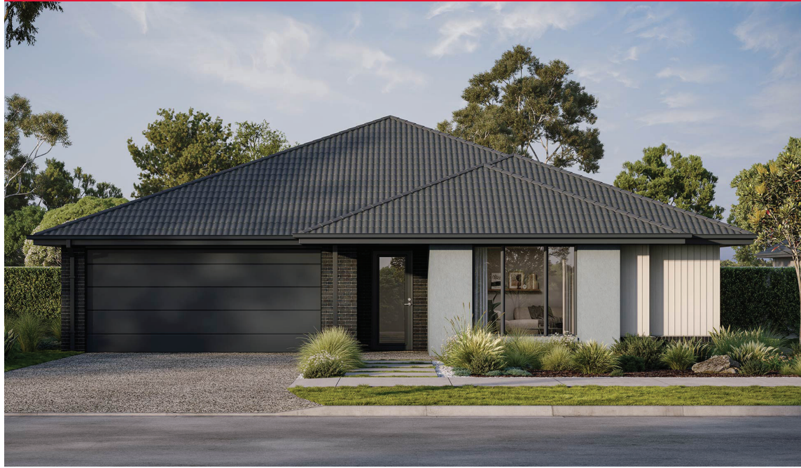
FAIRLIGHT 22 | EMERGE RANGE