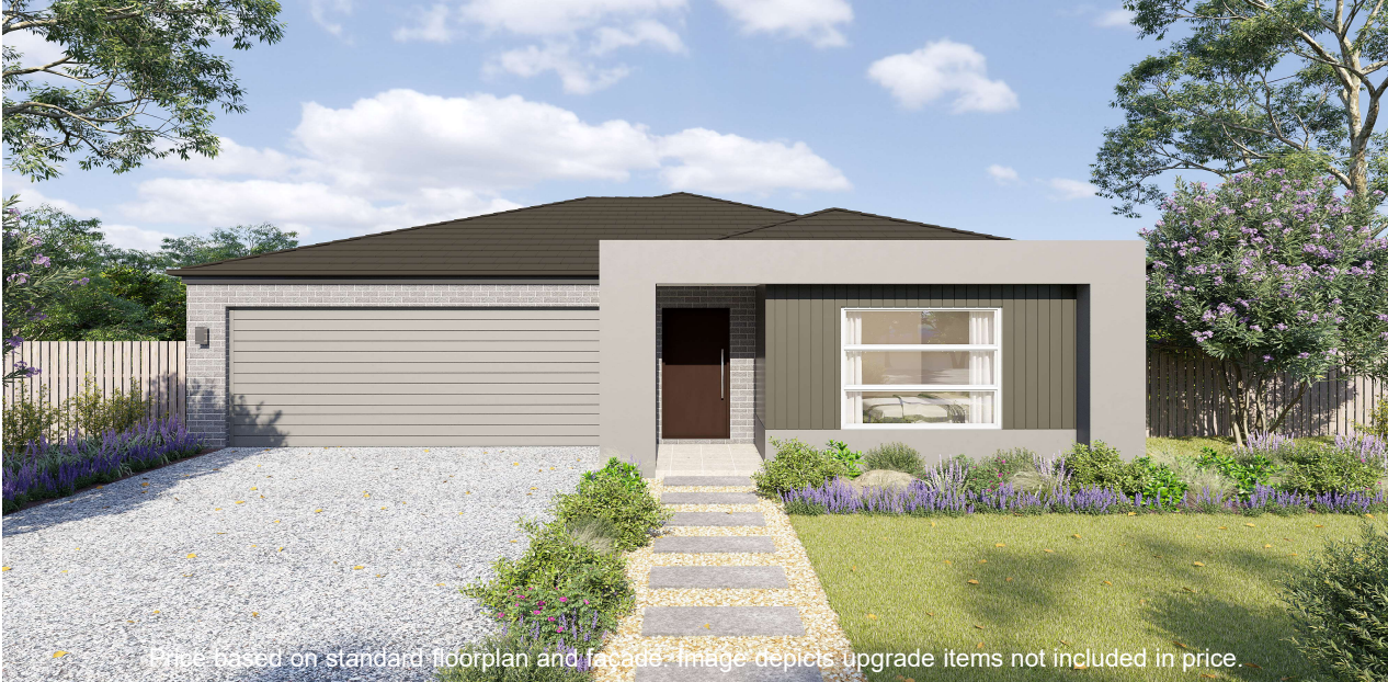
Price based on standard floorplan and facade image depicts upgrade items not included in price.