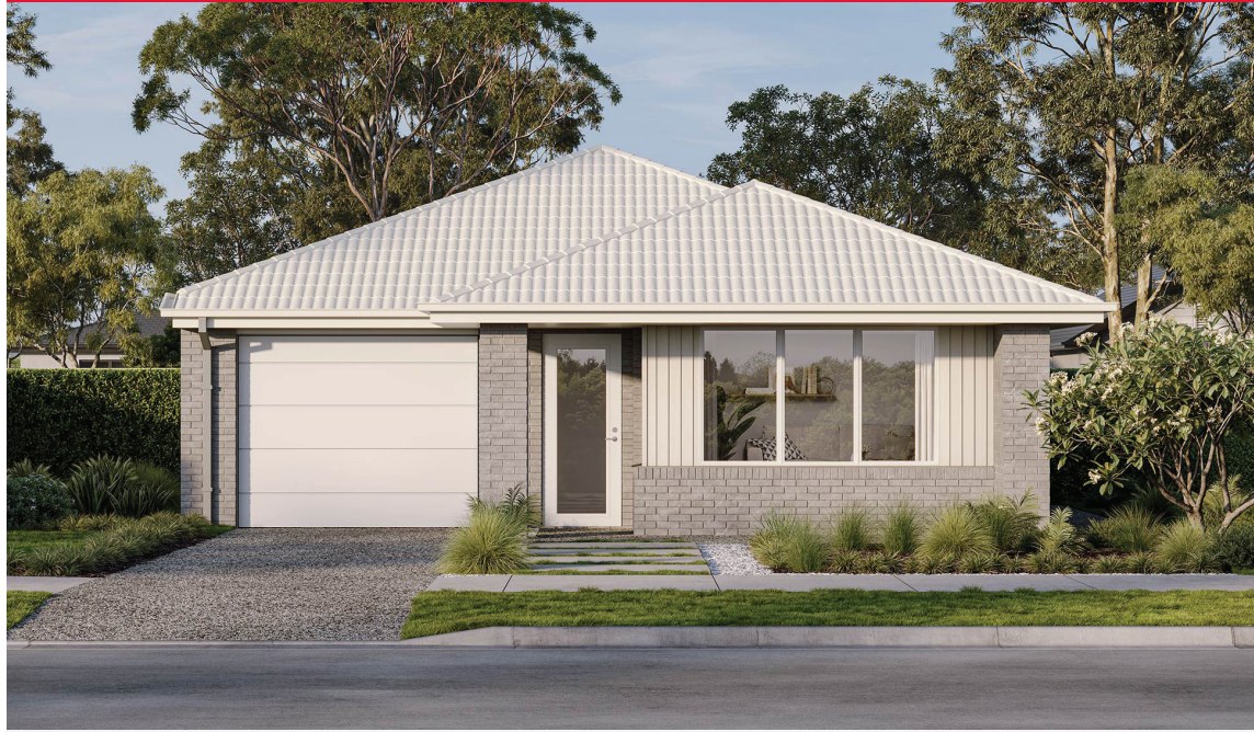
FINCH 18 | EMERGE RANGE