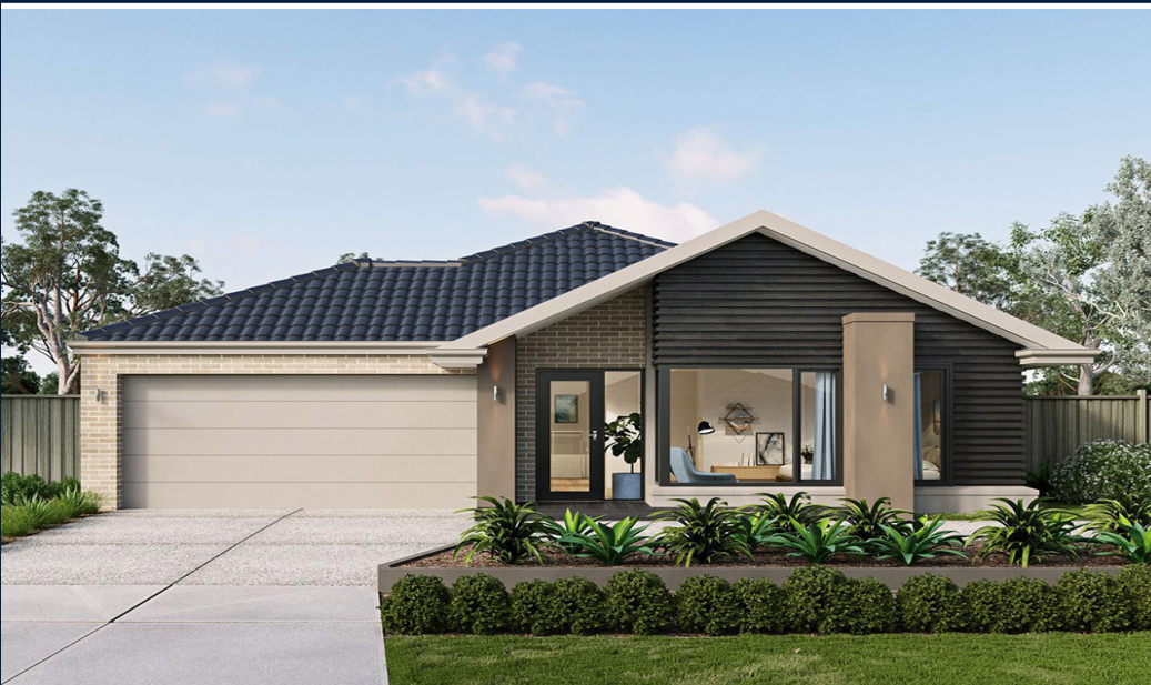
Price excludes upgrade items above standard specification such as feature render and bricks, front entrance timber decking, front entry door, brick infills above garage, external lighting, fencing, concrete paths and driveway. Façade Image may also contain items not supplied by Metricon Homes, namely landscaping and planter boxes.