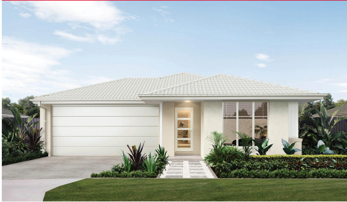
EMERSON 19_176 | METRO RANGE